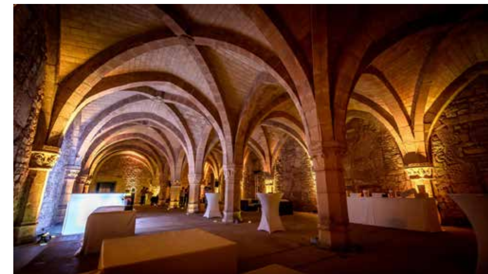
DR / CWN

Majestic vaulted ceilings make a truly exceptional site.